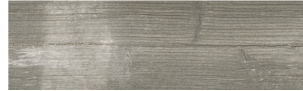
Rye 4.25" x 12.75"