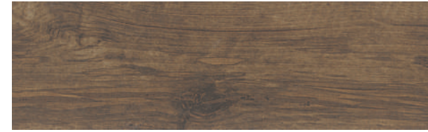
Stout 4.25" x 12.75"