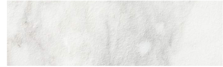
Ivoire Hammered 4.25" x 12.75"