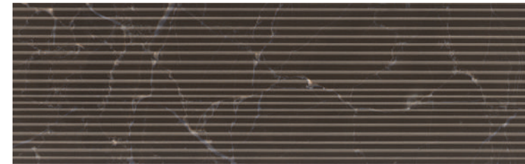
Brune Striped 4.25" x 12.75"