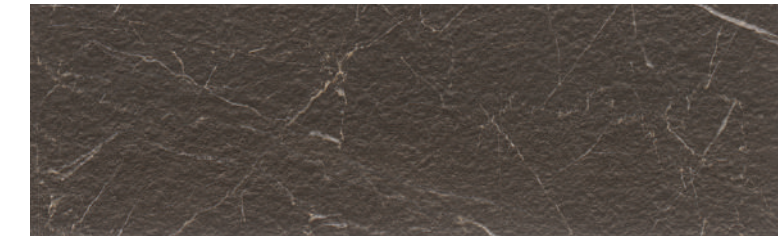
Brune Hammered 4.25" x 12.75"