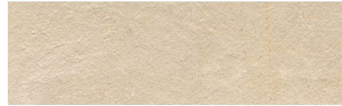
SoHo 4.25" x 12.75"