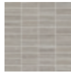
11¾"x11¾" (1"x3") Stacked Mosaic