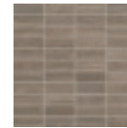
11¾"x11¾" (1"x3") Stacked Mosaic