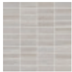
11¾"x11¾" (1"x3") Stacked Mosaic