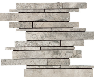
12"x13" Linear Insert Mosaic