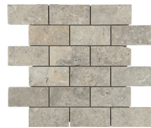
12"x12" (2"x4") Mosaic Tumbled