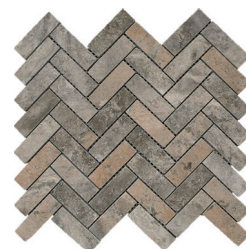
13½"x13½" (1"x3") Herringbone Mosaic