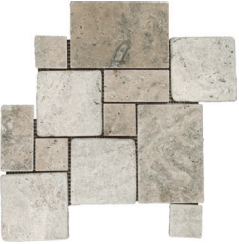
Versailles Pattern Mosaic Tumbled