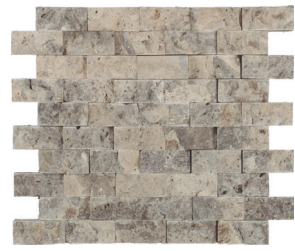
12"x12" (1"x2") Split-Face Mosaic