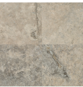
12"x24", 18"x18", 12"x12", 4"x12" Honed/Filled