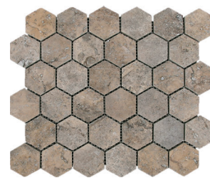
12½"x13" (2"x2") Hexagon Mosaic