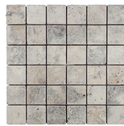
12"x12" (2"x2") Mosaic Tumbled