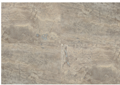
12"x24" Vein-Cut Honed/Filled