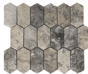
10¾"x13" (2"x4") Picket Mosaic