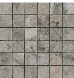
12"x12" (2"x2") Mosaic Honed/Filled