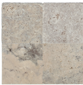
6"x6", 3"x6" Tumbled