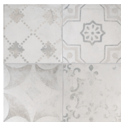
Cementine Mix (Four Individual Pieces Shown)