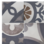
Vintage Mix (Four Individual Pieces Shown)